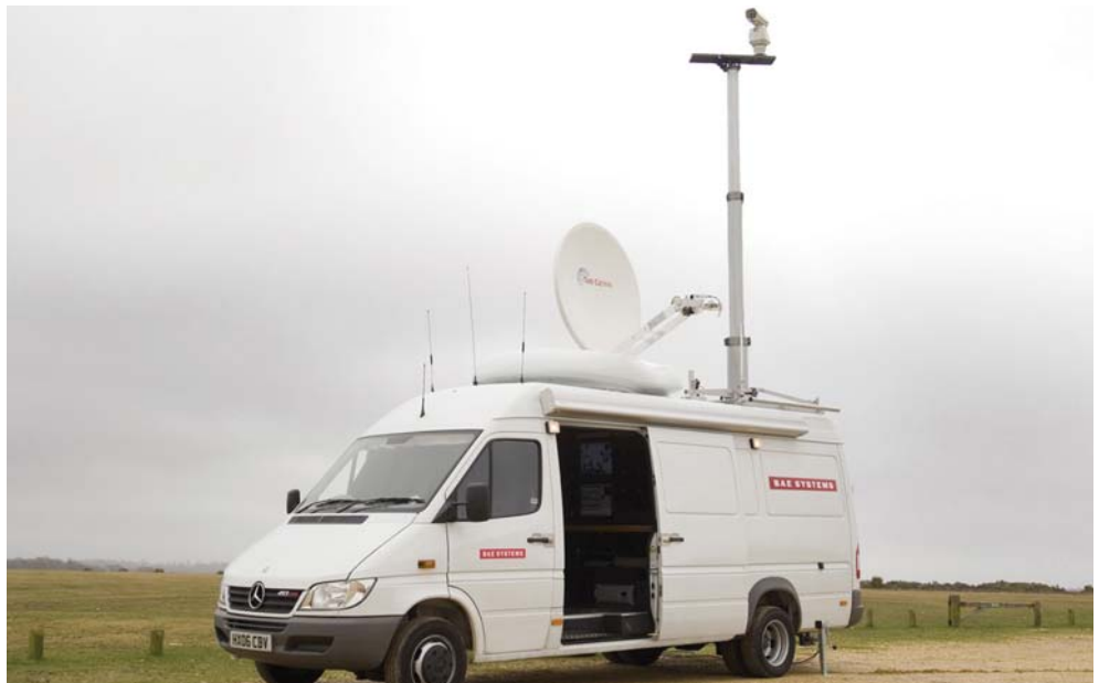
The DSU offers versatile vehicle choice dependent on operational requirements

Today's security climate demands continuous vigilance to guard assets against illegal activities; borders and coastlines require monitoring to prevent unauthorized access. The traditional approach of using fixed installations to provide full border protection and surveillance is costly, lacks flexibility and can lose the advantages of covert detection.