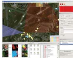
Spider command & control