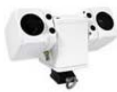
High quality cameras