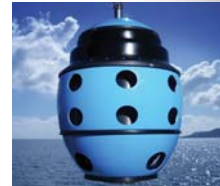
Underwater sensors, swimmer detection, sonar